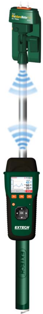
Wireless sensor affixes to telescoping handle